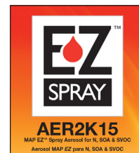
AER2K15/EZ label underneath