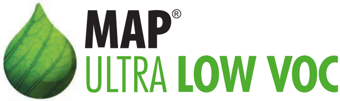
MAP Ultra Low VOC Drop